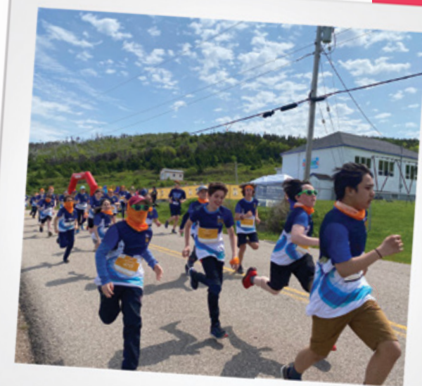
Pleasant Bay Fun Run